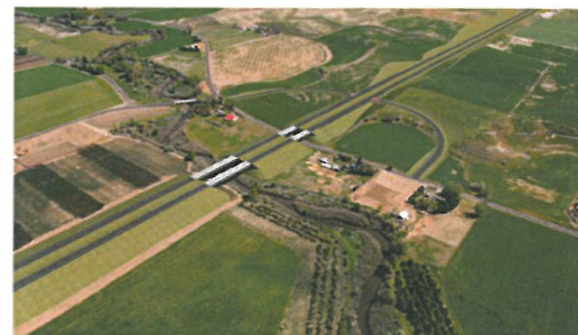
Design visualization of Touchet North Road

Estimated Total Project Cost ..... $195.0 million