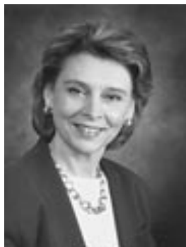
Governor Chris Gregoire

Governor Christine Gregoire signs the transportation revenue package. Included in the bill is $20 million for the U.S. Highway 12/124 Burbank Interchange, $36 million to four-lane U.S. Highway 12 from the City of Walla Walla to McDonald Road, near Lowden (Phase VI) and $4.23 million for the Myra Road extension to U.S. Highway 12. Senator Mike Hewitt is credited for making sure the U.S. Highway 12 projects were included in the transportation package.