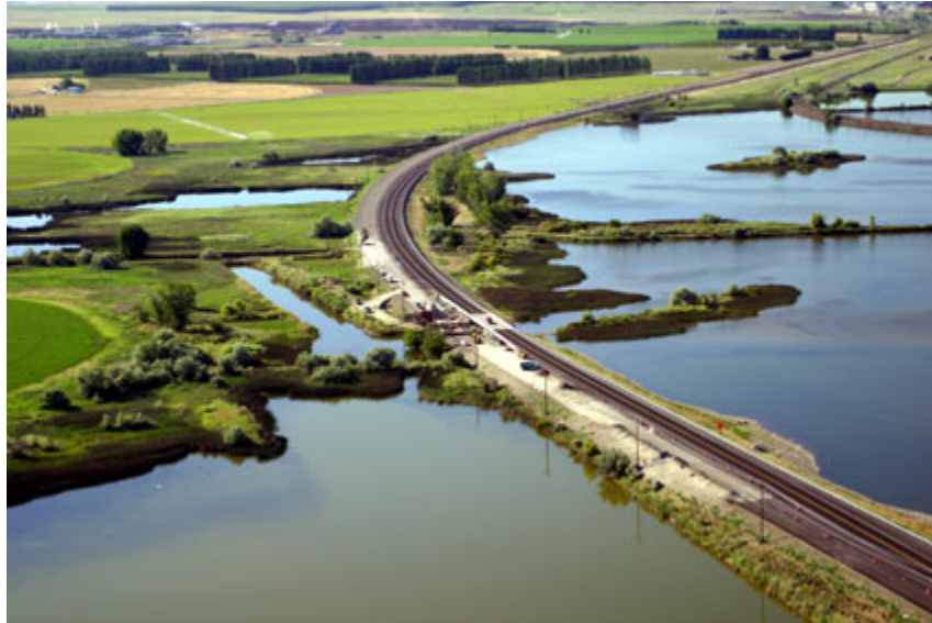
Casey Pond Section

Phase I completed ahead of schedule and within $11.1 million budget.