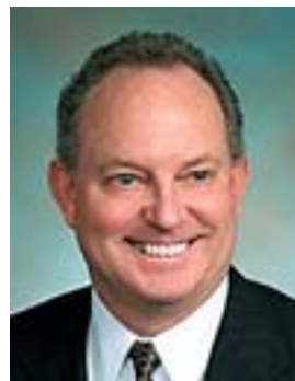
Senator Mike Hewitt