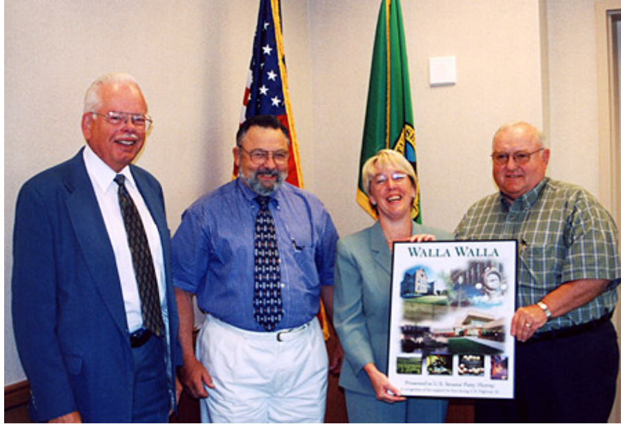
Fred Bennett, Port of Walla Walla Commissioner Dave Carey, Walla Walla County Commissioner Senator Patty Murray Jerry Cummins, Mayor, City of Walla Walla

Senator Patty Murray meets with U.S. Highway 12 Coalition in Walla Walla.